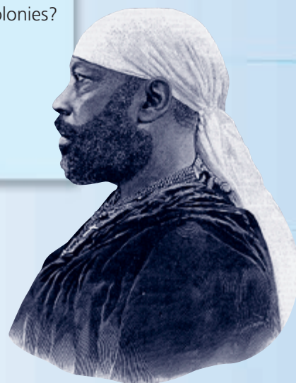
Ethiopian ruler Menelik II defeated the Italians at the Battle of Adowa in 1896.

This sculptured brass weight was used by the Asante people of Africa. The elaborate nature of the weight may indicate that trade was especially important to the Asante. The British traded with the Asante on the west coast of Africa, also known as the Gold Coast.