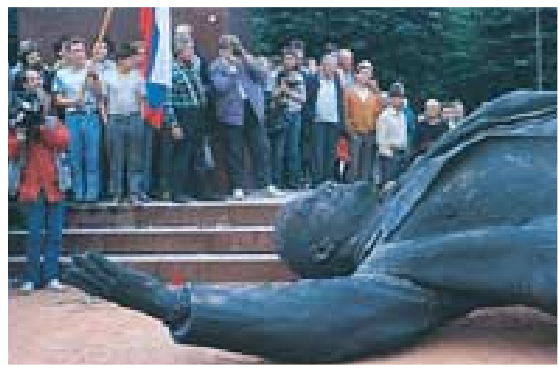
This statue of Lenin, the leader of the 1917 Russian Revolution, was toppled by Latvian citizens in 1991.