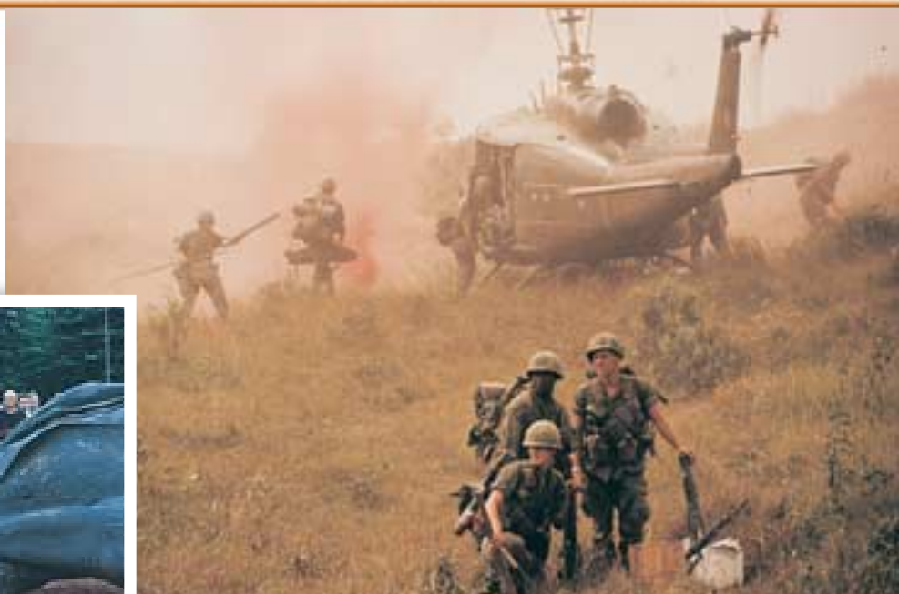
U.S. forces in Vietnam in 1968